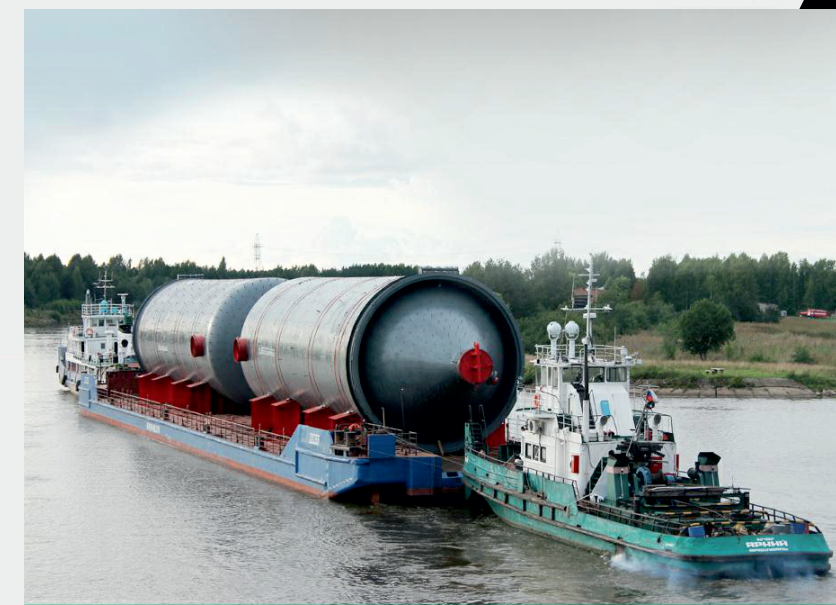
TOWAGE OF OBJECTS